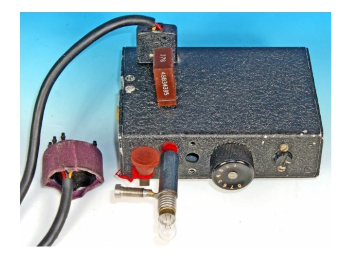
The 'Plug-in transmitter French 1' retrieved its power from a normal broadcast receiver, substituting the AF output valve by a socket and cable. See also Chapter 79.

A scan from a recently emerged photograph taken by the GDR MsF kindly given by Detlev Vreisleben revealed a later type Morse keyer captured in possession of a French agent, most probably a replacement of the 'sliding plate'. It may be speculated that this Morse keyer could have been used with other French agents transmitters of that period. Morse code numbers 0-9 were transmitted by setting the pointer to a number in the inner row (1-5), and extending the slider for the numbers 6 to 0. Rotating the handle at the right hand side completed a single number. Obviously not at a high speed, but with some practice a speed of 9-12 wpm could be achieved.